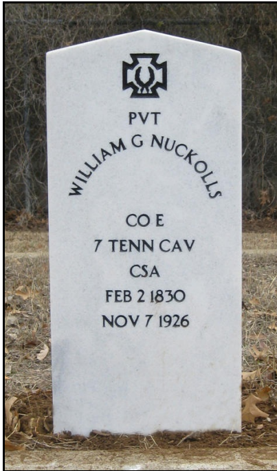
New headstone installed by E. W. Taylor Camp, #1777, SCV February 23, 2013